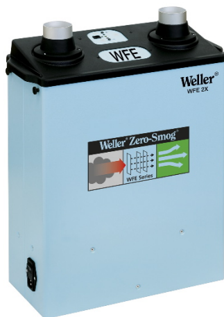
New mobile fume extraction unit WFE 2X purifies air up to two workplaces!

It is important to protect yourself from harmful solder fumes with the best fume extraction system possible. This is why you need a Weller® Zero-Smog® Fume Extraction System. Our new mobile fume extraction unit WFE 2X purifies air up to two workplaces!